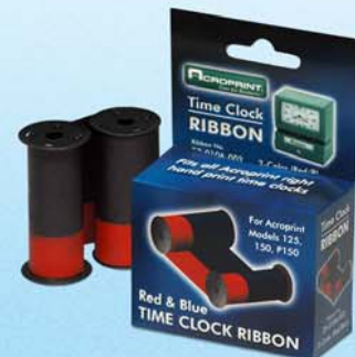
Model 150 AUTOMATIC PRINT