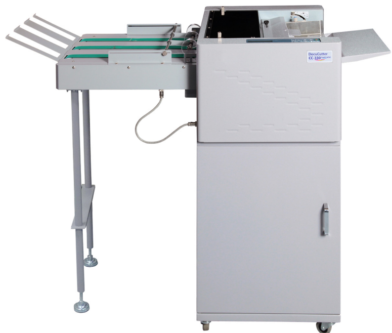
| CC-330 Card Cutter with optional conveyor |