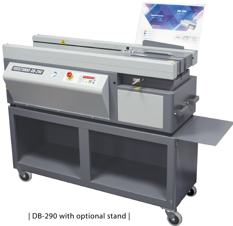
| DB-290 with optional stand |