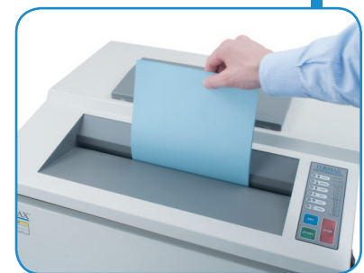
Standard Infeed accommodates up to 24 sheets at once

Formax - New Hampshire, USA www.formax.com