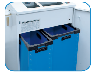
Separate Waste Bins for Paper and Optical Media