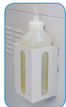
EvenFlow™ Automatic Internal Oiling System

*Capacity varies depending on paper and power supply