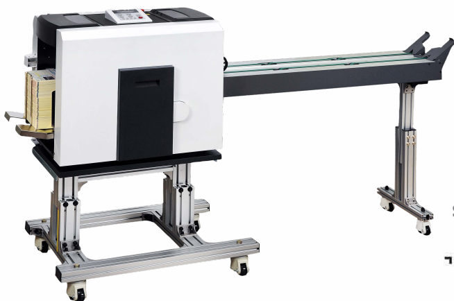
Shown with Adjustable Stand and Long Conveyor

the most advanced heavy duty office pressure sealer