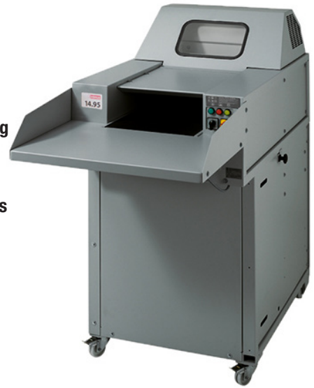
W/D/H 80/120 x 168 x 164 cm

The spacious feed table with integrated infeed conveyor belt provides controlled, effortless, safe and fast loading. The shredded material is collected in large-scale, mobile or swing-out containers under the cutting mechanism. The shred-press combinations are coupled to a baler for immediate fully automatic compaction of the cut material into compact bales. Reduction effect compared to the loose collection of the cuttings is about 70%.